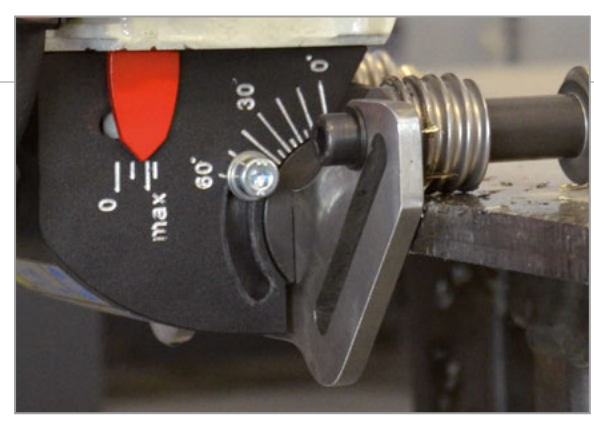
Continuous angle adjustment from 0 to 60 degrees