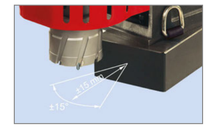
Swivel base is standard on all D3XRS Swivel base: \pm 15°, \pm 9/16 " (15 mm)